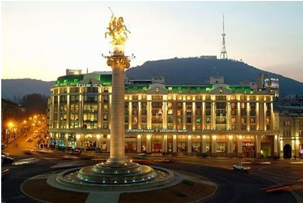
St. George Monument, Liberty Square, Tbilisi, Georgia

Conference is organized by the Georgian Technical University