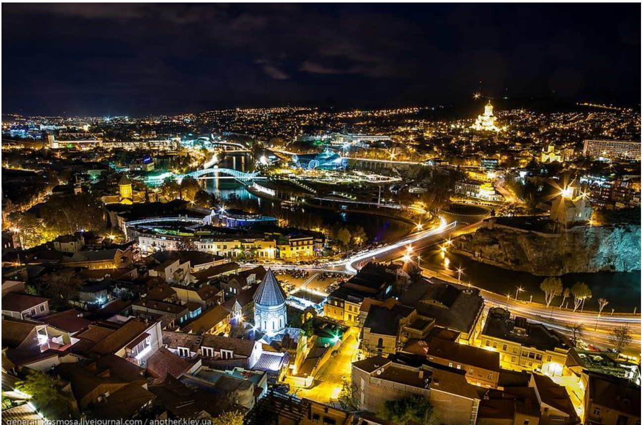
Tbilisi by night